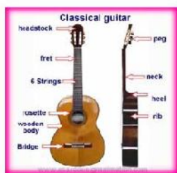
The Guitar and its part