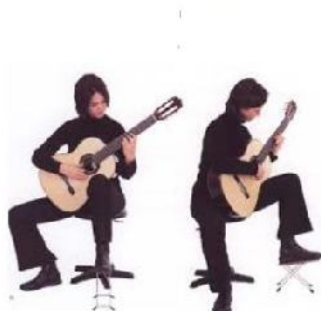
Position for holding the guitar